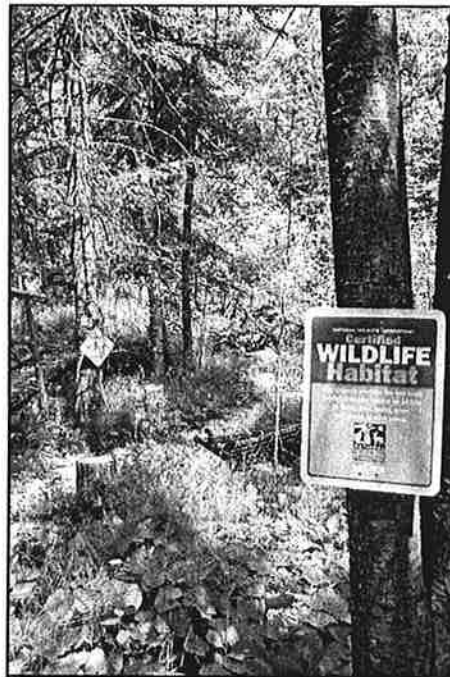
Your yard can be certified as a wildlife habitat (see Appendix A).

Lord knows the critters need our help as they're pushed towards being endangered and even extinct by loss of habitat, which is the number one factor