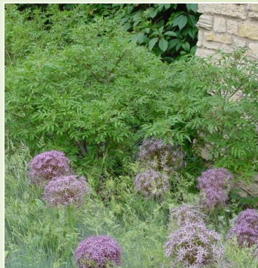
Rhus 'Prairie Flame'

Invasive plants threaten our environment and economy. Invasive plant species pose an enormous threat to our native plants, animals and ecosystems; their toll on the environment is second only to habitat destruction. Invasive plants can also alter communities by changing the hydrology or soil chemistry. Invasive plants cost the United States approximately $35 billion per year ( www.invasivespecies.gov ).