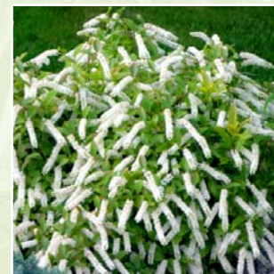
Itea 'Little Henry'