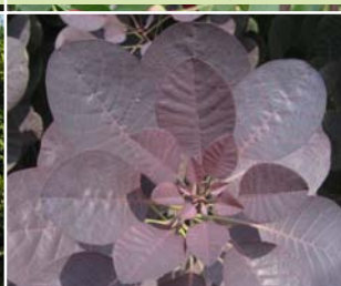
Cotinus cogg. Royal Purple