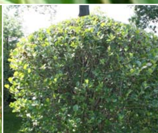
Aronia mel Elata