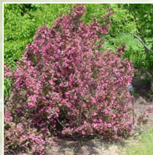
Weigela 'Wine and Roses'