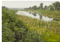
Native Wetland Plants

Many of the plants found in the area ecosystems can also thrive in your yard, on corporate and university campuses, in parks, golf courses and on road sides. These native plants are attractive and benefit the environment. Many native plant seeds or seedlings are available from nurseries.