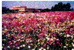
Native Prairie Plants